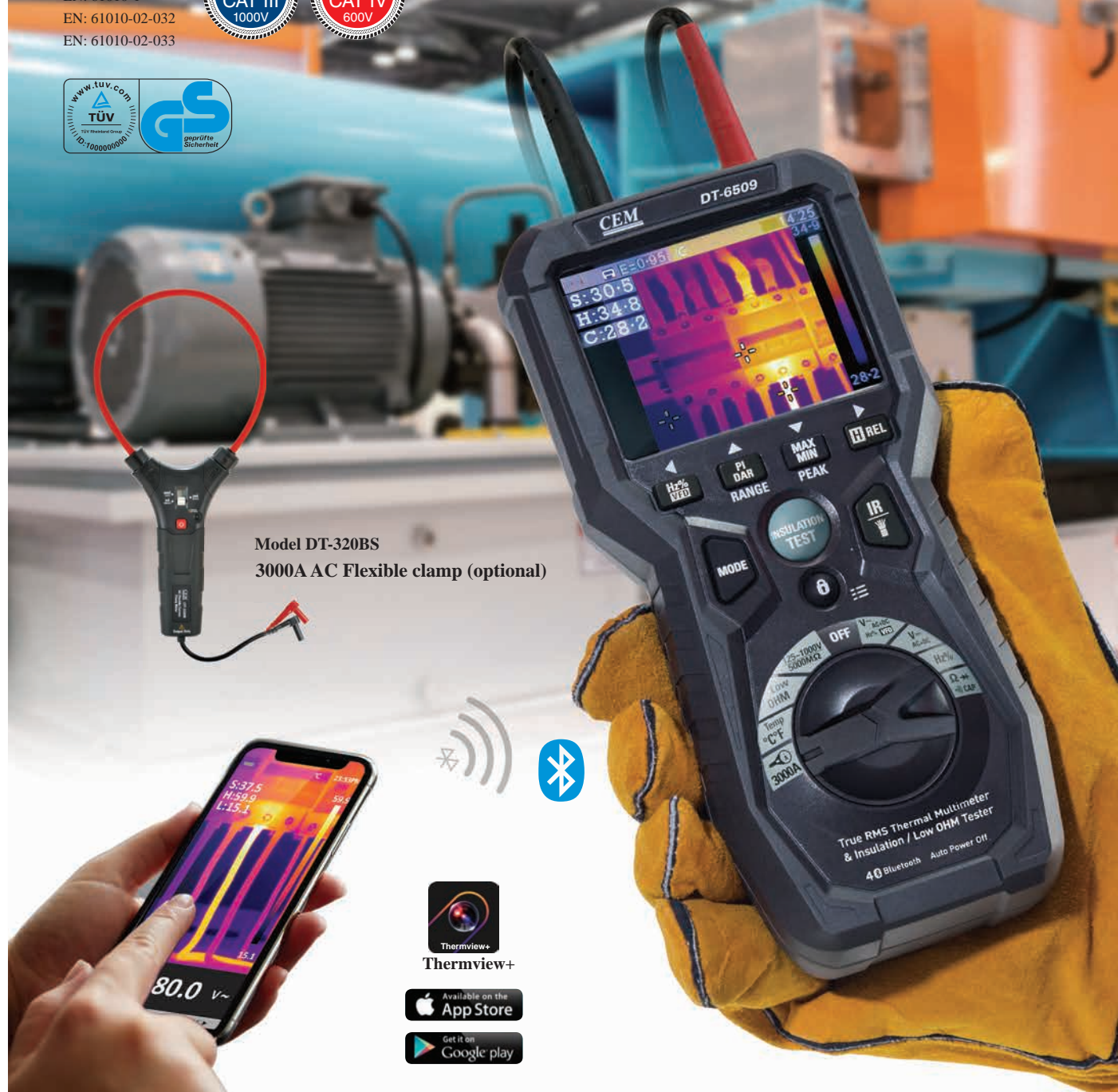
Model DT-320BS 3000A AC Flexible clamp (optional)