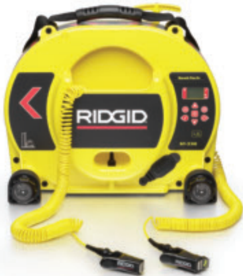
SeekTech ST-33Q Long Range Transmitter

Locating with RIDGID transmitters gives you the power and versatility to quickly and accurately trace underground lines, cables, and pipes!