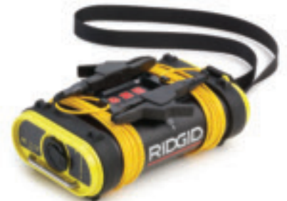
SeekTech ST-305 Line Transmitter