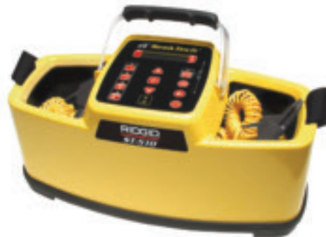
SeekTech ST-510 Line Transmitter