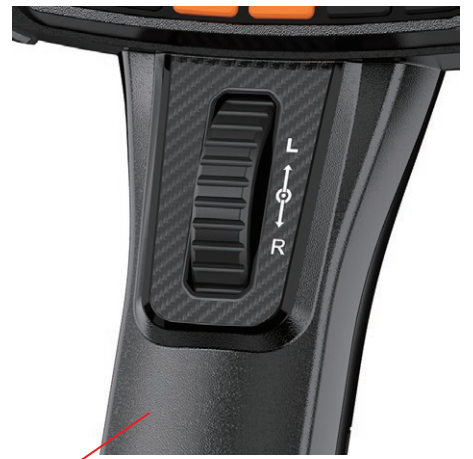
Anti-slip silicone coated roller