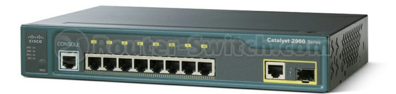
Table 1 shows the Quick Spec of the WS-C2960-8TC-L.

Figure 1 shows the appearance of the WS-C2960-8TC-L.