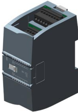
SIMATIC S7-1200, Digital output SM 1222, 16 DO, 24 V DC, transistor 0.5 A