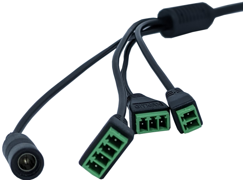
APC Core Connections

Please be aware specifications can vary from time to time