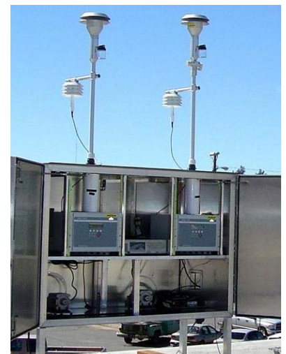
Optional BX-906 Dual-Unit Shelter