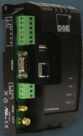
DSE890 DSEWebNet® Gateway 3G (GSM)/Ethernet

A gateway device is required to use DSEWebNet®. There are two different variants available.