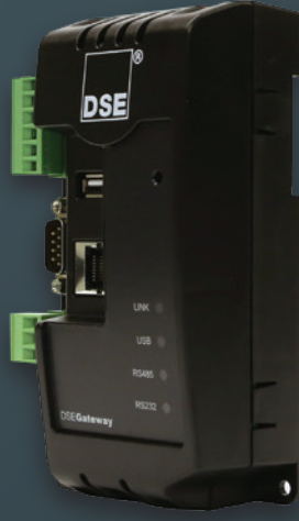
DSE891 DSEWebNet® Gateway Ethernet Only