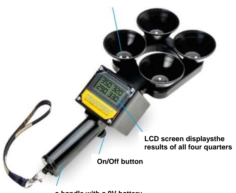
a handle with a 9V battery