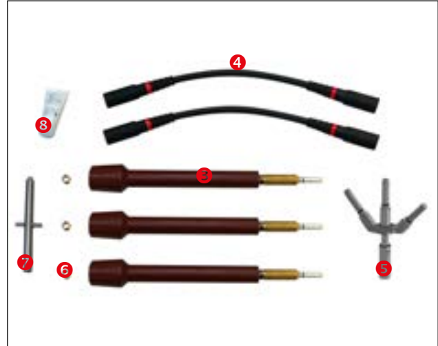
Elbow adapter set VLF CS-SF6-UNI-L (long – 460 mm) or K (short – 310 mm)