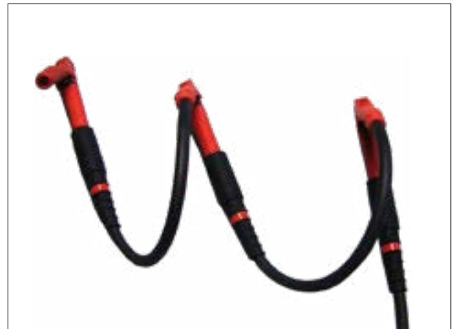
Installation of the 3-phase pliers' adapter set

For the proper installation of the elbow adapter, adhere to the installation instructions in order to avoid damage to both the specimen and the adapter. A tube of silicon grease will be enclosed with the delivery, which is required for the installation of the elbow adapter.