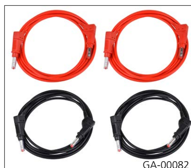
Test lead set, 4 x 2 m (6.5 ft)