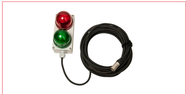
Indicator box (Safety beacon)