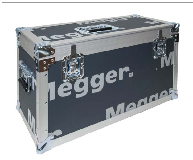
Transport case GD-00182