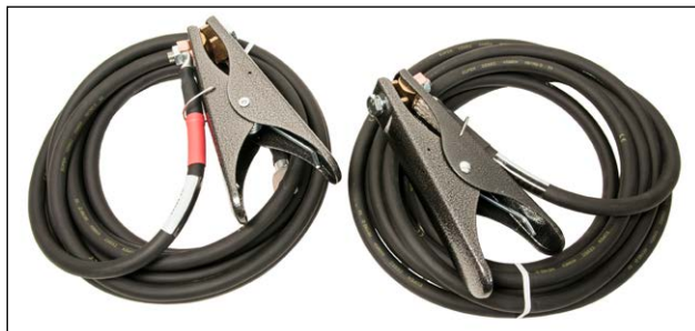
Cable set, GA-05052. Cable cross section area 50 mm 2