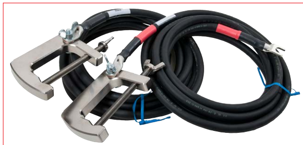
Cable set GA-07052. Cable cross section area 70 mm 2 and 100 mm clamp jaw width. The sets GA-07102 and GA-09152 have the same clamps.